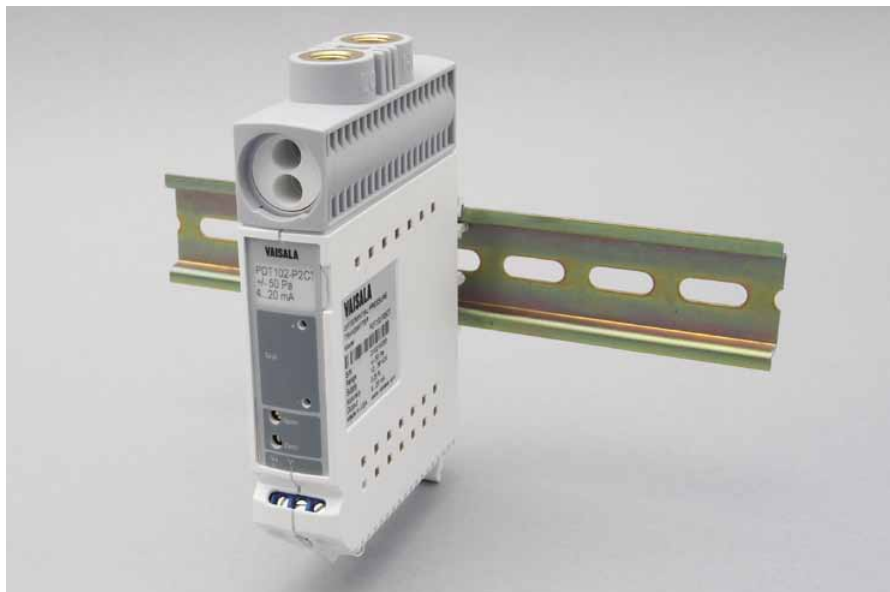
Vaisala Differential Pressure Transmitter PDT102 with process valve actuator and test jacks.