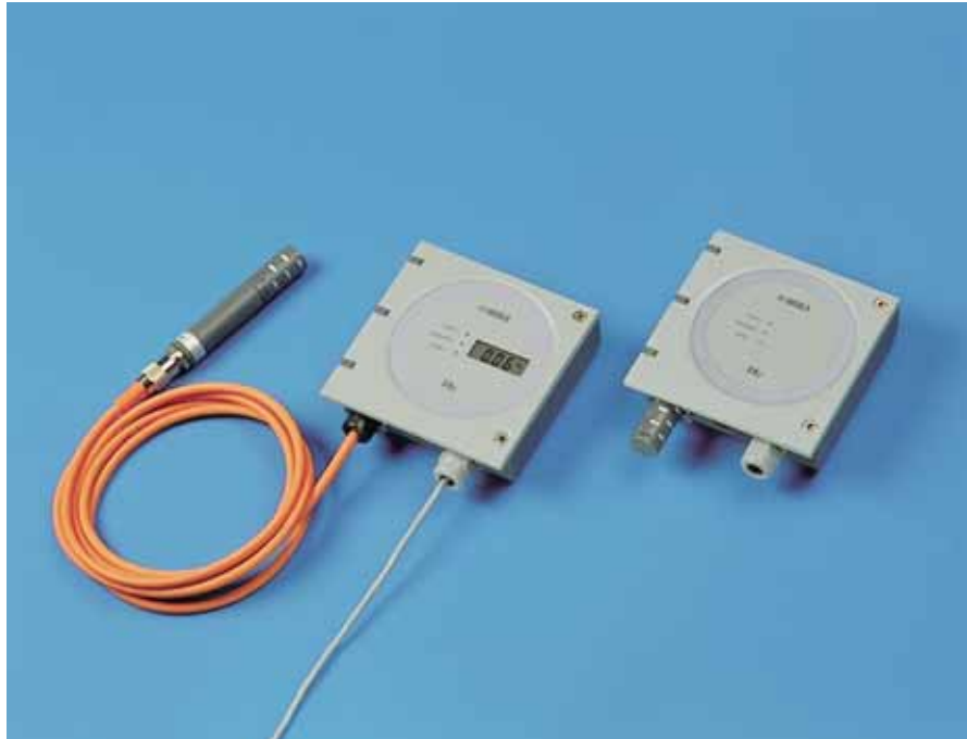
The GMT220 transmitters withstand harsh and humid environments.

The Vaisala CARBOCAP® Carbon Dioxide Transmitter Series GMT220 is designed to measure carbon dioxide in harsh and humid environments. The housing is dust- and waterproof to IP65 standards. The materials have been chosen for good corrosion resistance.