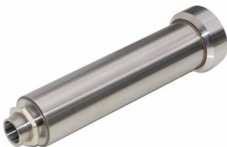
Protective and cooling housing WK11