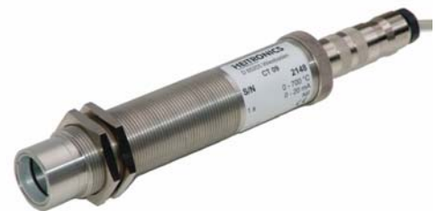
CT09 Dimensions in mm