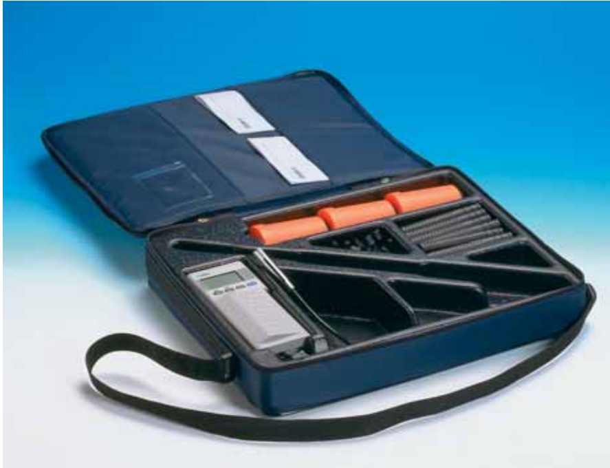
The Vaisala HUMICAP® Structural Humidity Measurement Kit HM44 provides an easy and reliable solution for humidity measurements in structural material.

Excess moisture in structures can cause problems and economical losses. In new construction, the tight time schedule may not allow enough time for structures to dry completely. Later, excess moisture can cause surface deterioration, room air impurities, and in severe cases – mold. These problems often lead to expensive repairs.